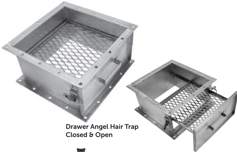
Drawer Angel Hair Trap Closed & Open