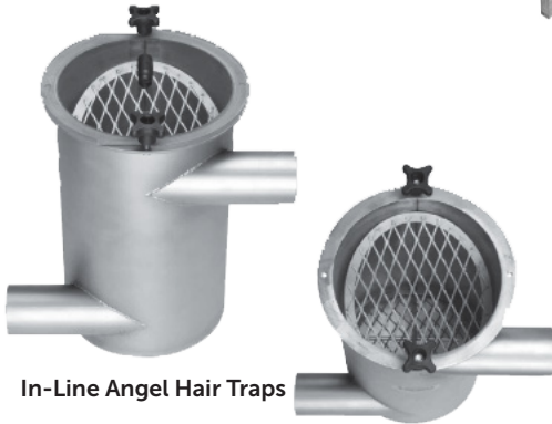
In-Line Angel Hair Traps