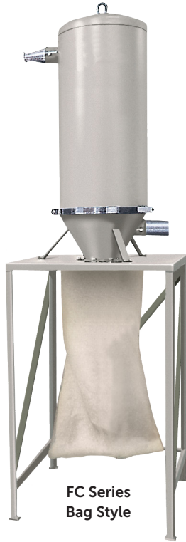
FC Series Bag Style