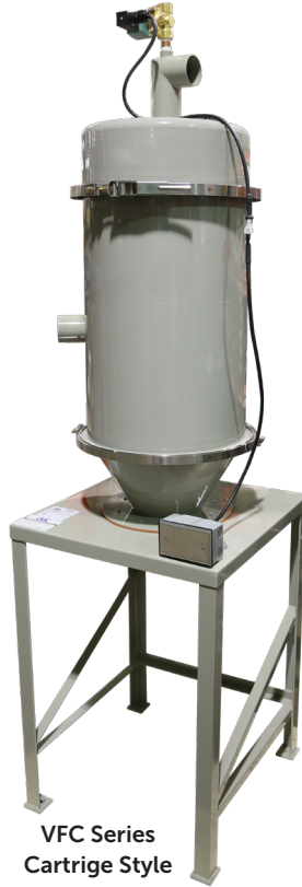
VFC Series Cartridge Style