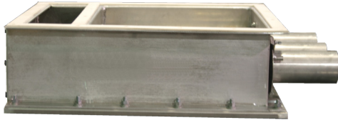
EVTO - Main Box with Filter Assembly