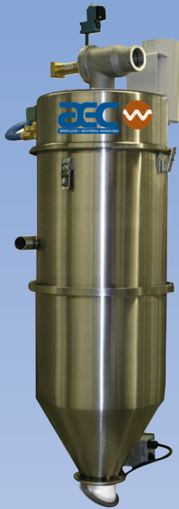
PHL-50 High Capacity Powder Hopper Loader