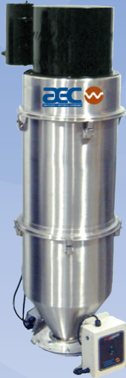
PHL-50 Powder Hopper Loader