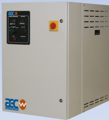
AD Floor Mount Model Desiccant Dryer