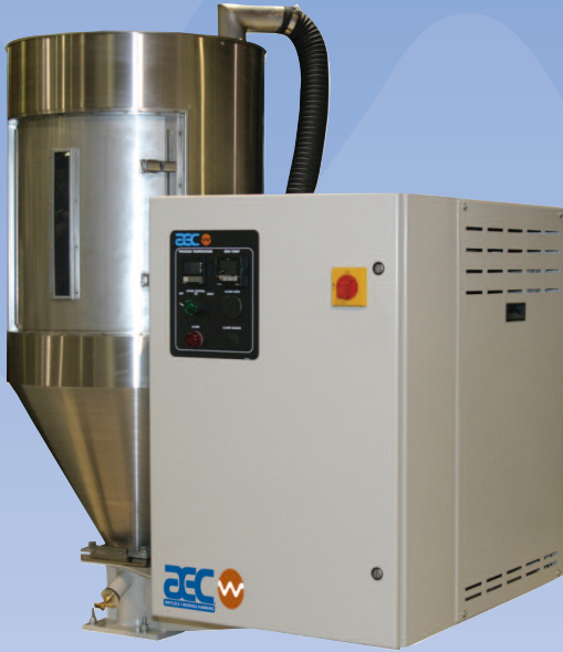
AD-M Machine Mount Dryer with Hopper