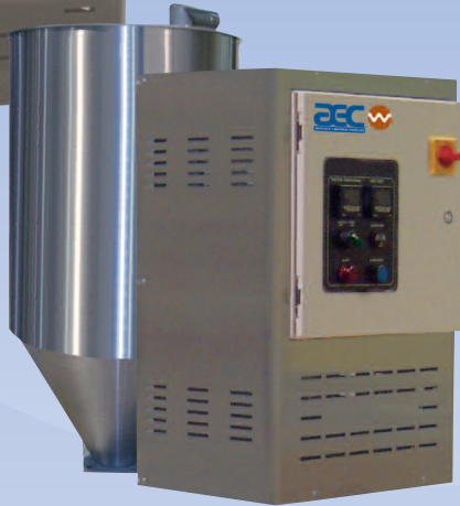
ACM30/3.0 Machine Mount Dryer with Hopper