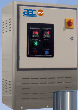
ACM30F Floor Model Dryer